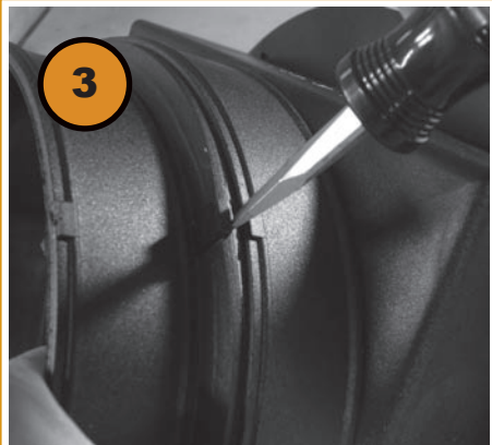
3 Twist screwdriver to initiate separation of unneeded collar section(s).