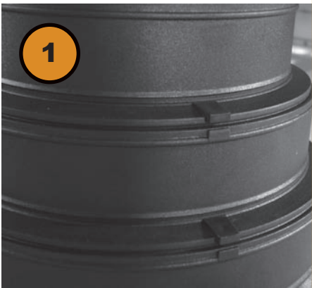
1 Locate collar removal slots. If using smallest collar size, collar removal is unnecessary, skip to step 5.