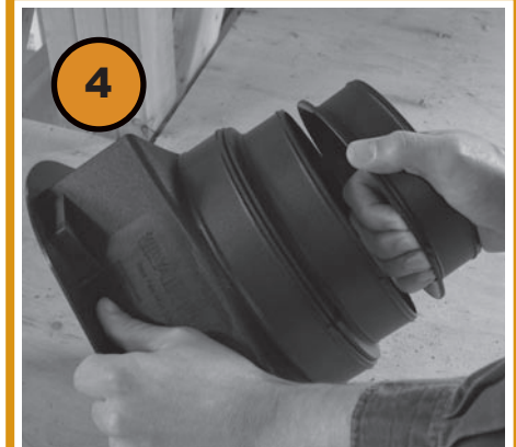
4 Grasp unneeded collar section(s) behind separation slot and pull firmly.