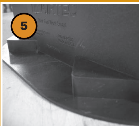
5 If furring or strapping for drywall is in use, position MH against framing member with pictured stand-offs contacting underside of framing member.