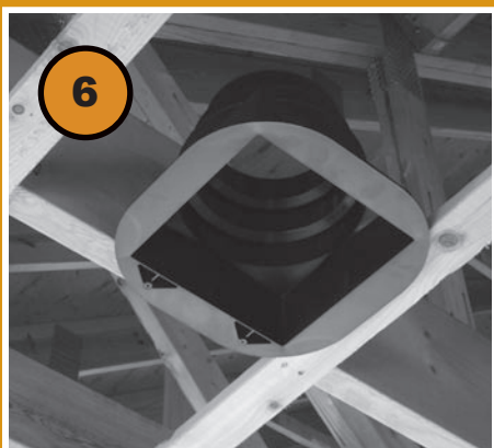
6 Attach MH to framing by screwing through provided openings below stand-offs.