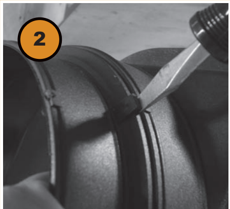
2 Place flat screwdriver head into the appropriate slot to remove unneeded collar(s).